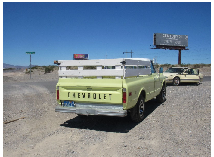
On the way to Wheeler Pass