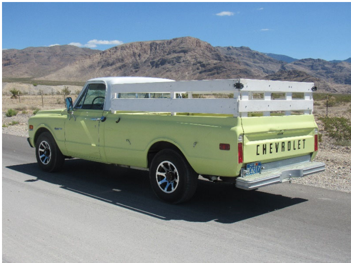
On the way to Mt. Charleston to gather firewood.