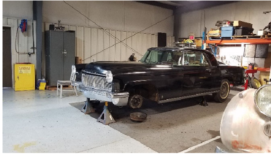
Mercedes the students are aiming to restore for the Pebble Beach Concourse