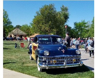
1948 Chrysler Town & Country convertible