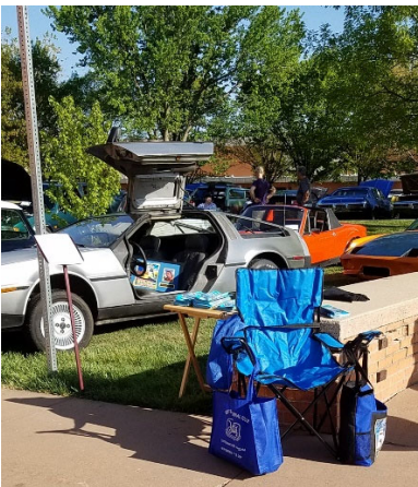
VMCCA table near students' cars