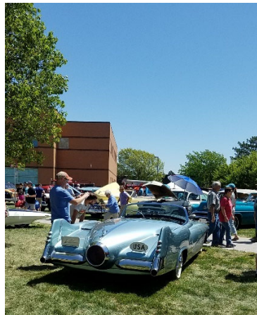
1951 General Motors LeSabre concept car