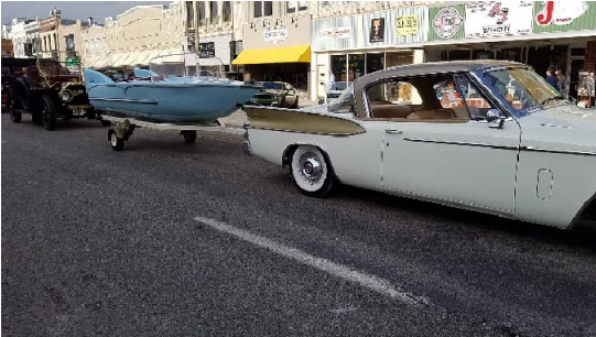
Cruise-In, downtown McPherson