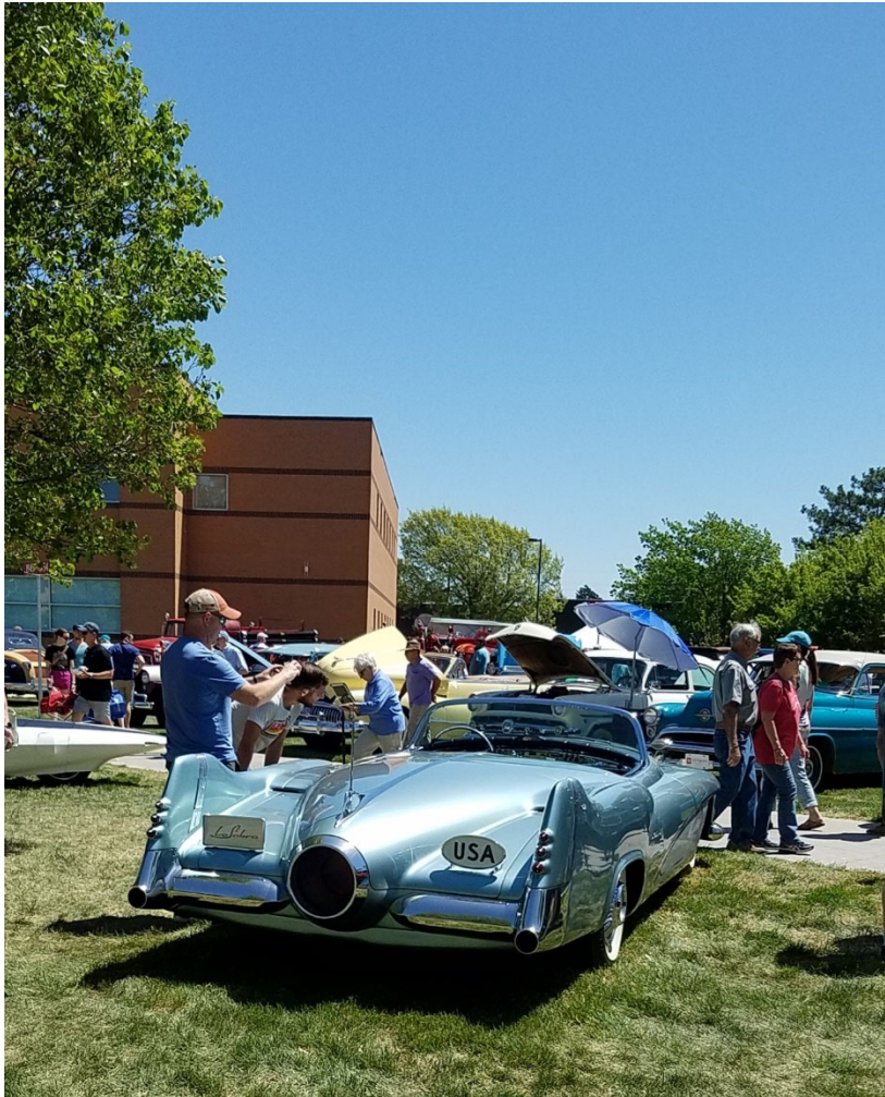
1951 General Motors LeSabre Concept Car