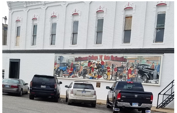
Mural in downtown McPherson, Kansas